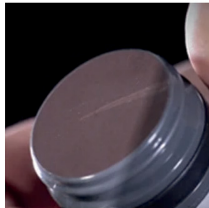
Sealed Strike Pad

Our water-resistant Typhoon Match Kit floats in water for extra peace of mind. An O-ring creates a waterproof seal that protects the 15 Typhoon Matches from moisture and keeps them dry.