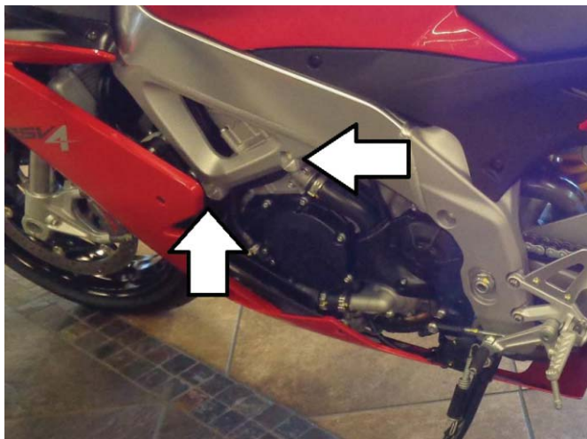
Assembly positions. Left and right sides