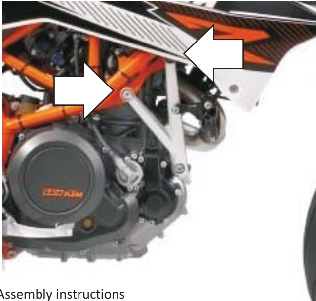
Assembly position (BOTH SIDES)