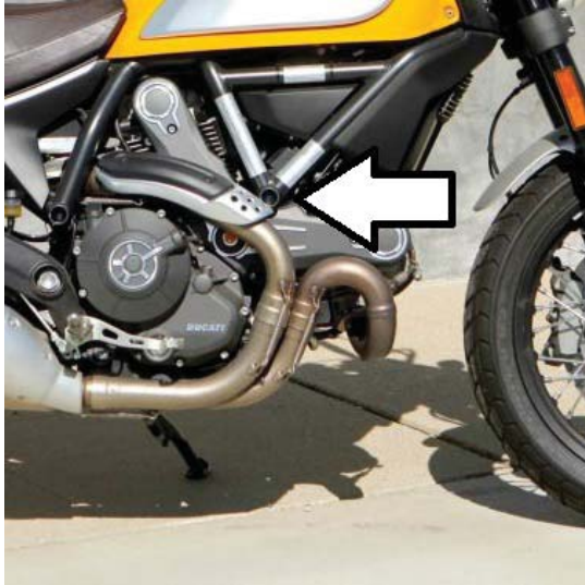
Assembly position (both sides)