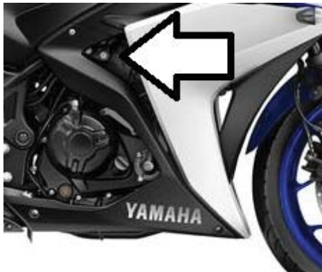
Assembly position (both sides)