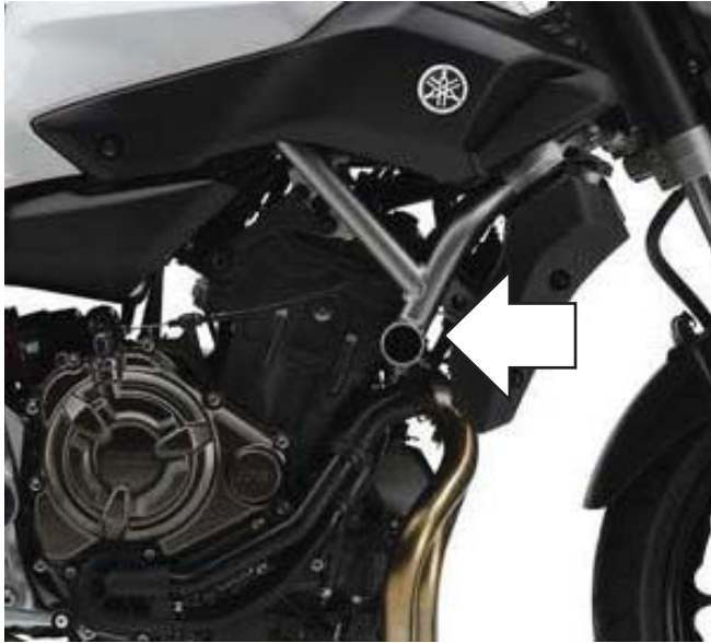
Assembly position (both sides)