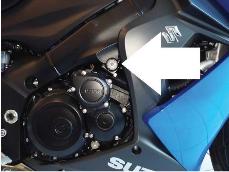
Assembly positions (both sides)