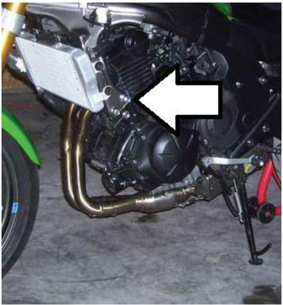
Assembly position (both sides)