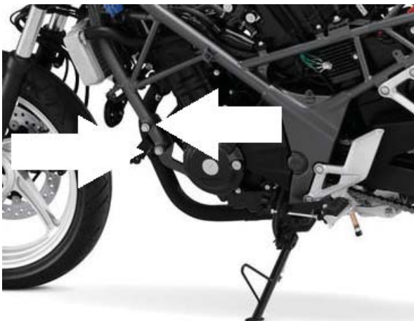
Assembly positions (both sides)