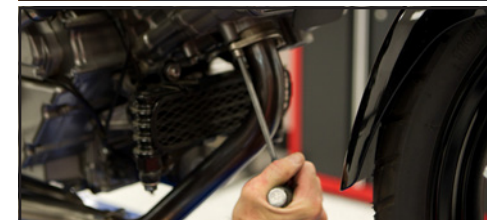
(LEFT SIDE OF BIKE) Header bolt