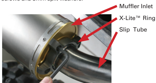
V.A.L.E.™ Assembly Detail