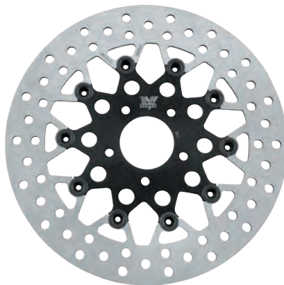
Floating Mesh Black