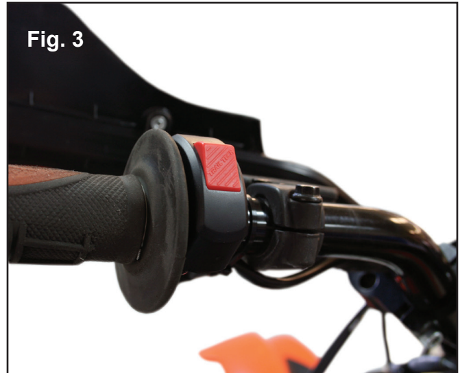
TRAIL TECH IGNITION MAP SWITCH INSTALLED