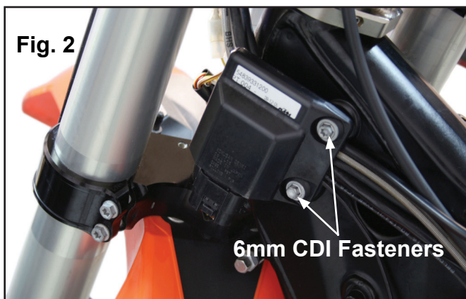
6mm CDI Fasteners