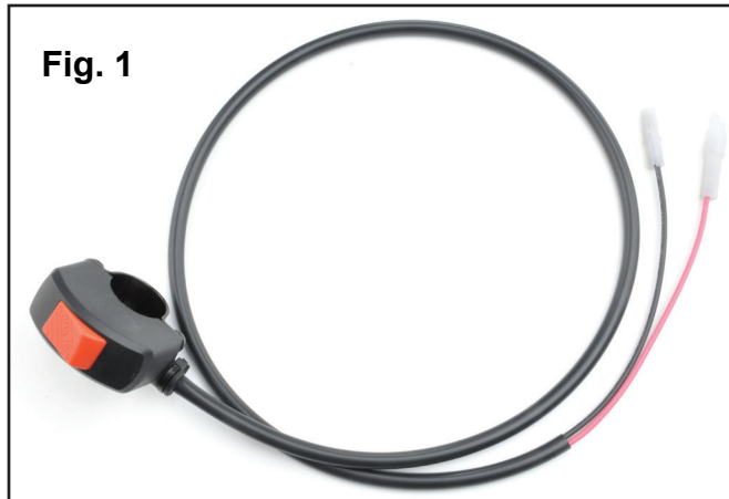
TRAIL TECH IGNITION MAP SWITCH