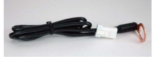
Head Temperature Sensor