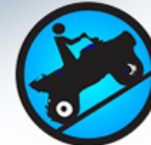
YOUR ATV GRIPS!