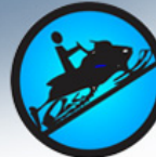
YOUR SLED GLIDES!