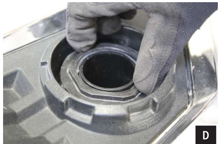
D. Unscrew and remove gas cap and gas cap nut (driver side only).