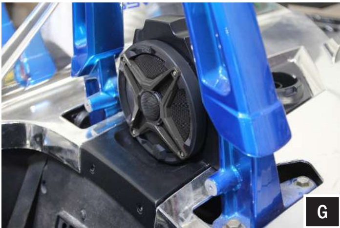
G. Insert the rear tab of the speaker pod into the notch on the vehicle, then lower into place