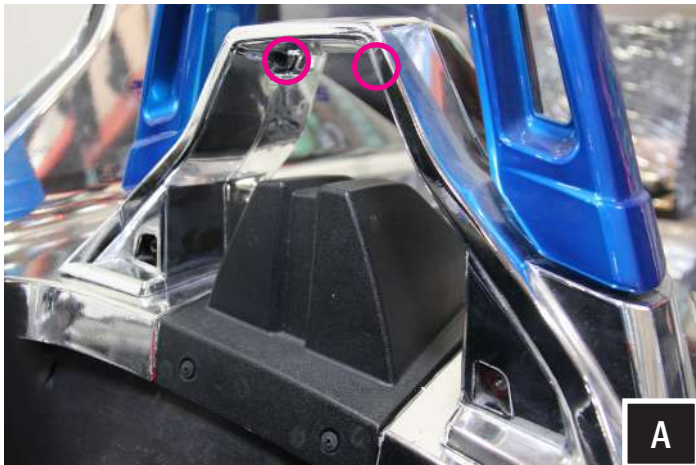
A. Use a T25 Torx driver to remove upper screws from the headrest frame (2 places).