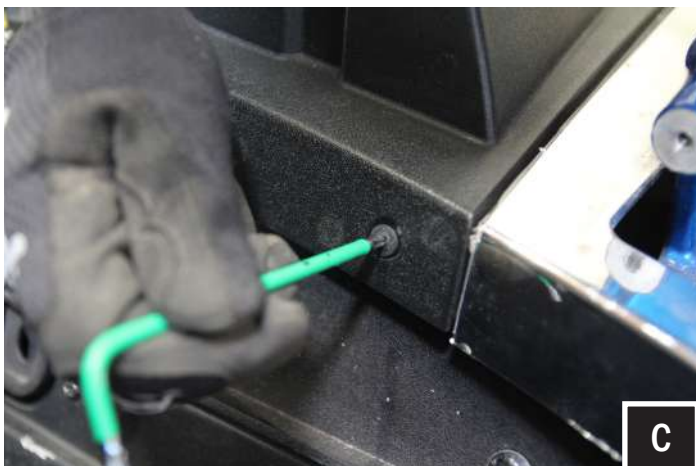
C. Use a 2.5mm hex driver to remove screws from the front of the headrest pod (2 places).