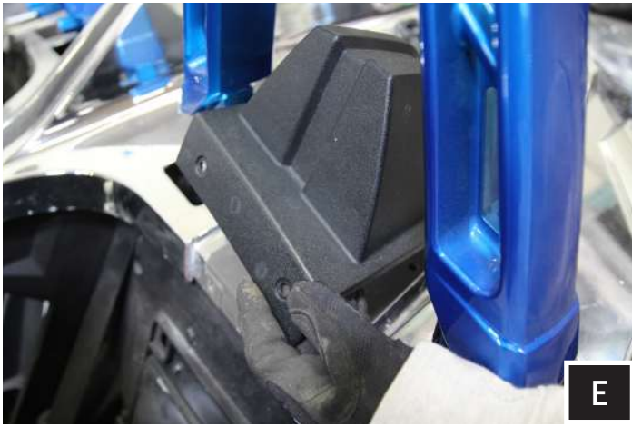
E. Remove the headrest by lifting from the front