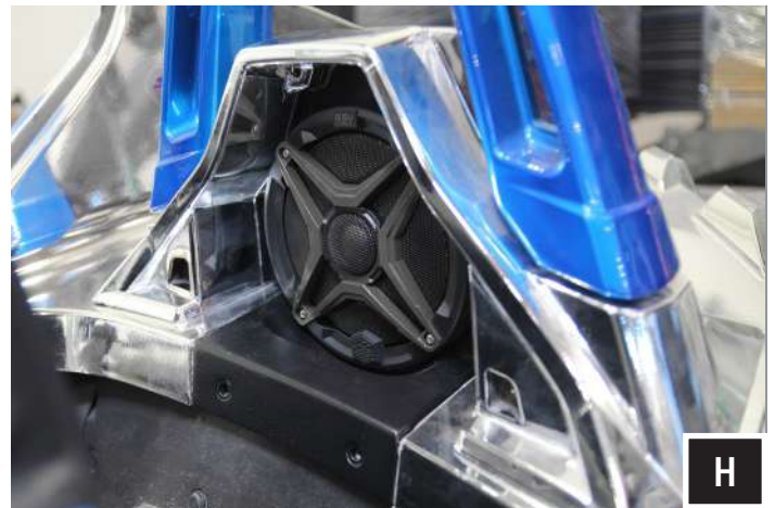
H. Re-install gas cap nut (driver side only). Re-install gas cap (driver side only). Re-install screws in the front of the speaker pod (2 places). Re-install headrest frame.