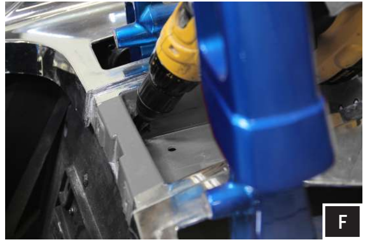
F. Drill an opening for the speaker pod harness in location shown