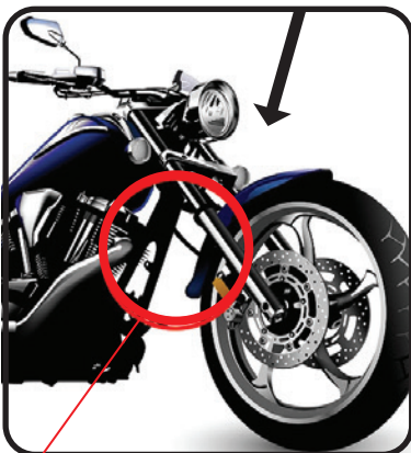
Mount photo optic sensor under fairing pointing downward.