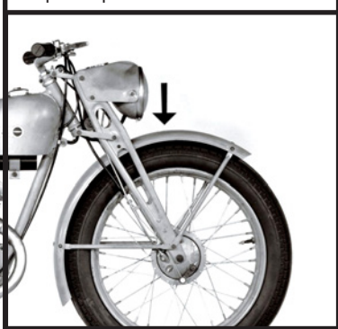
Step 7: Optic Sensor Placement.

Note: fluorescent or LED lighting will not activate the module; to test use an incandescent light source or move outdoors.