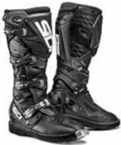
BLACK | BLACK