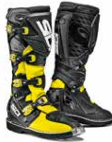
YELLOW FLUO | BLACK