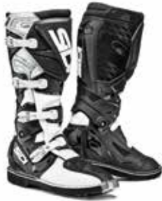
WHITE | BLACK