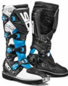
WHITE | LIGHT BLUE | BLACK