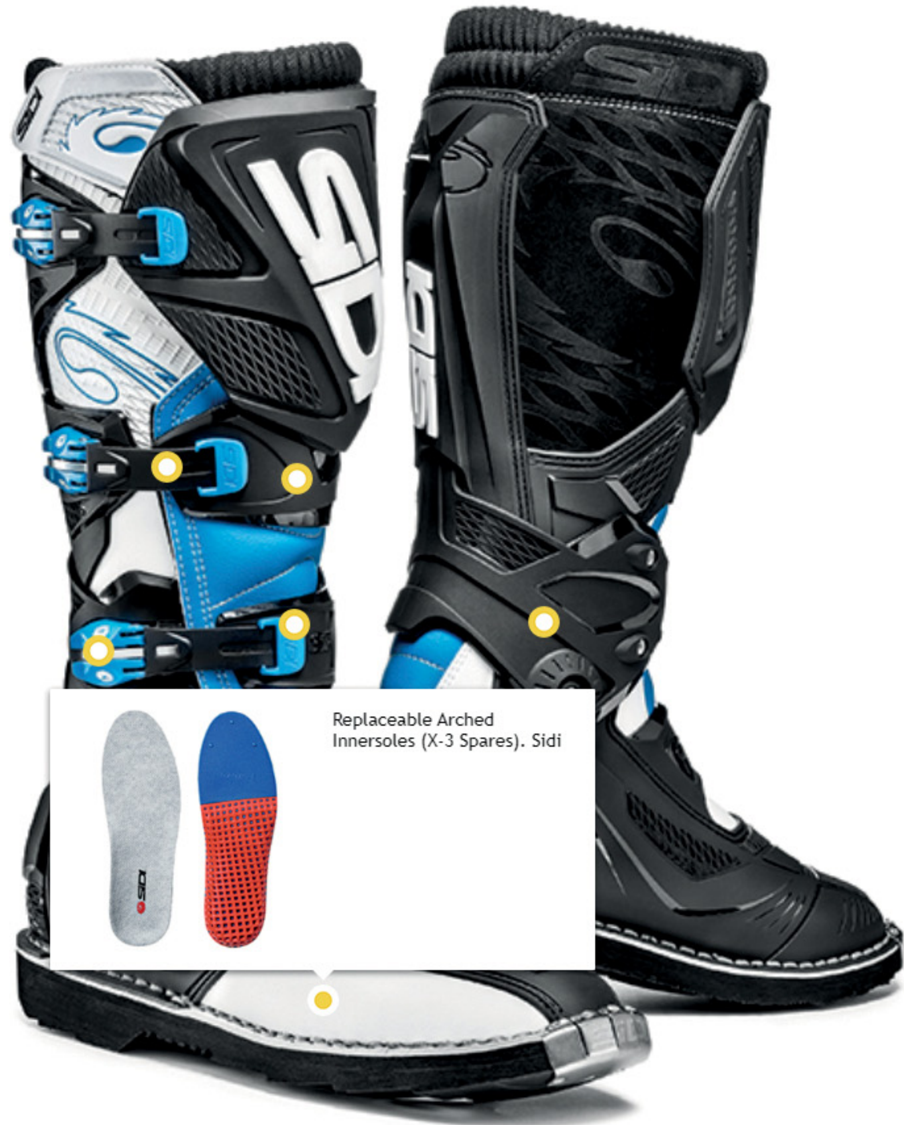
Replaceable Arched Innersoles (X-3 Spares). Sidi