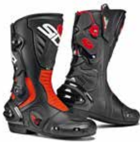
BLACK | RED