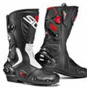
BLACK | WHITE