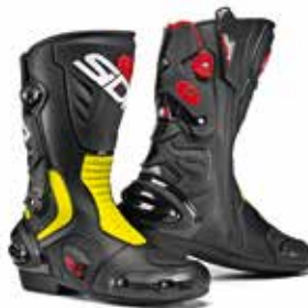
BLACK | YELLOW FLUO