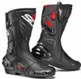
BLACK | BLACK