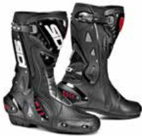
BLACK | BLACK