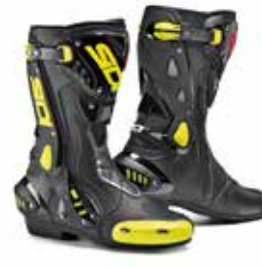
BLACK | YELLOW FLUO