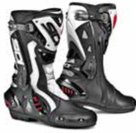
BLACK | WHITE