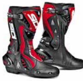
BLACK | RED