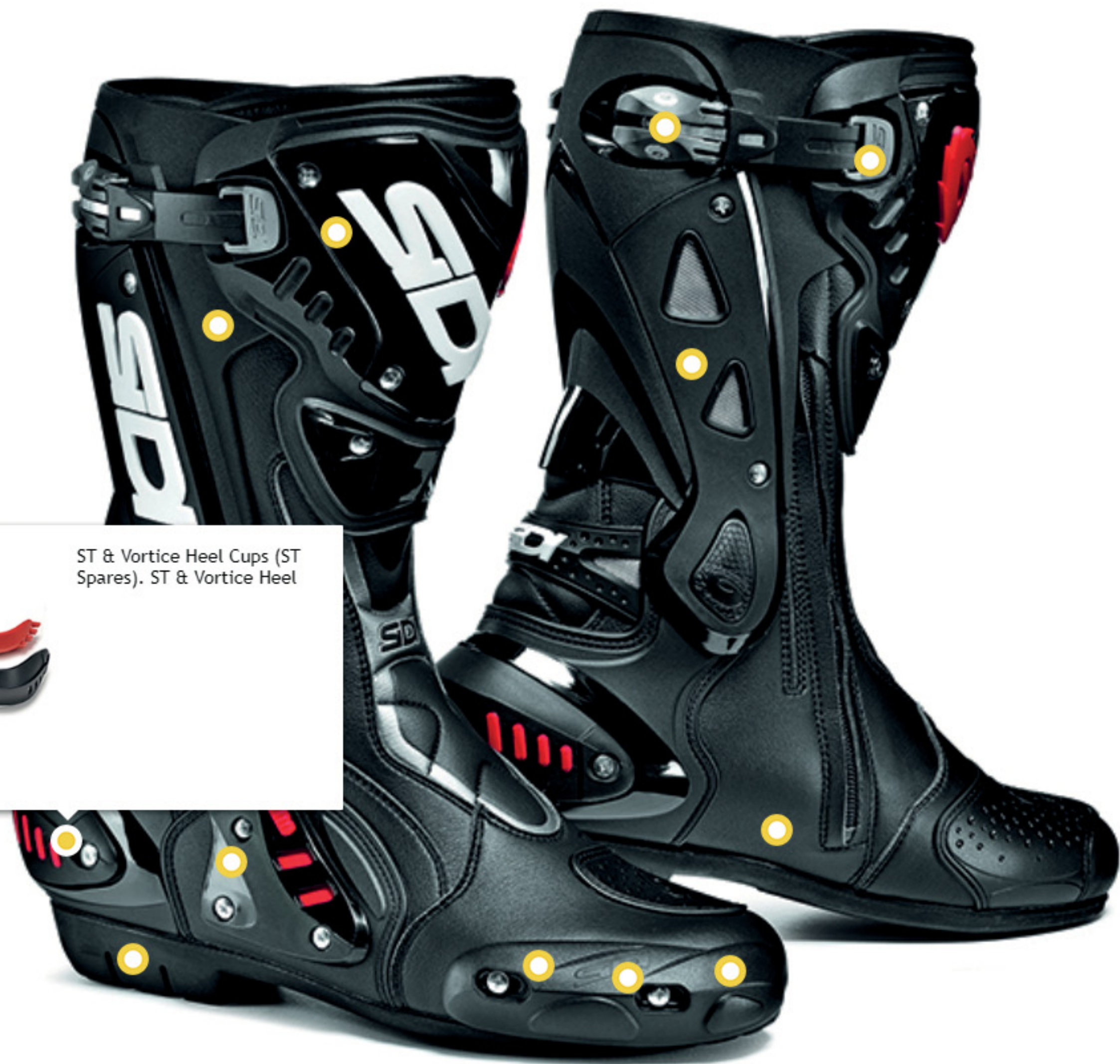
ST & Vortice Heel Cups (ST Spares). ST & Vortice Heel