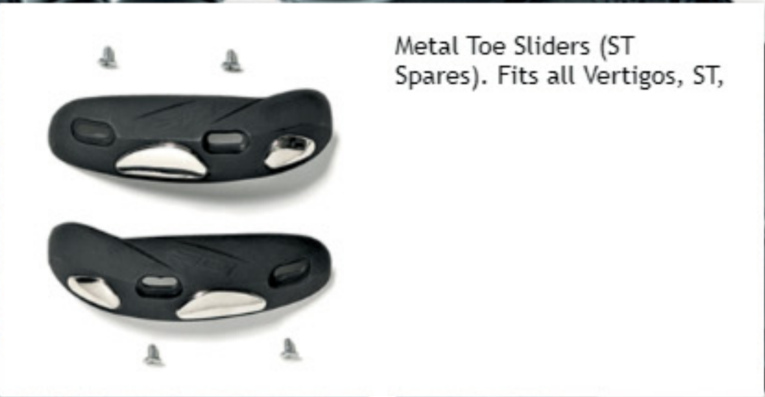
Metal Toe Sliders (ST Spares). Fits all Vertigos, ST,