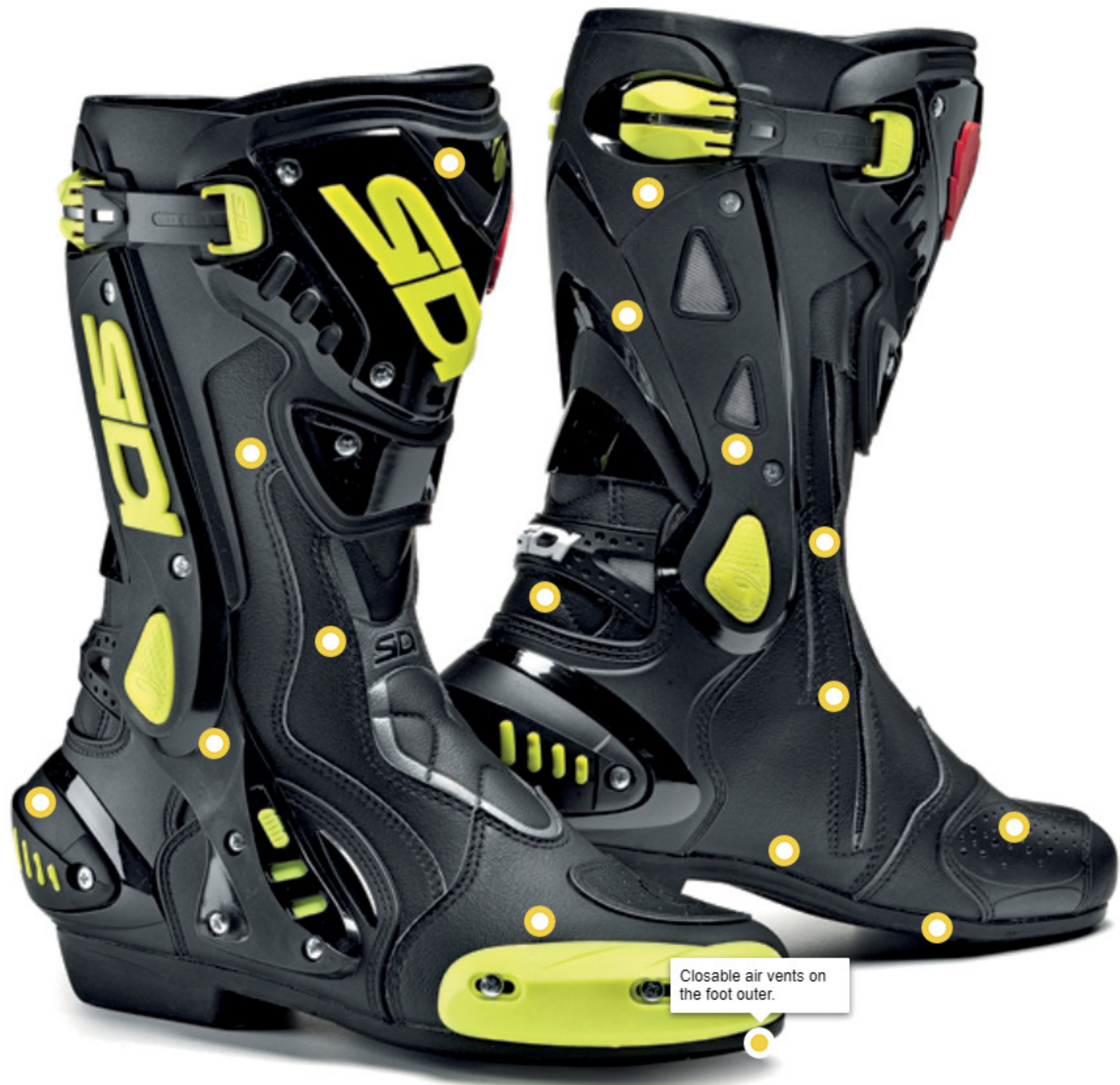
Closable air vents on the foot outer.