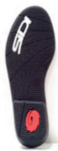
Sport Boot Soles (ST Spares). These soles fit all Sidi sport