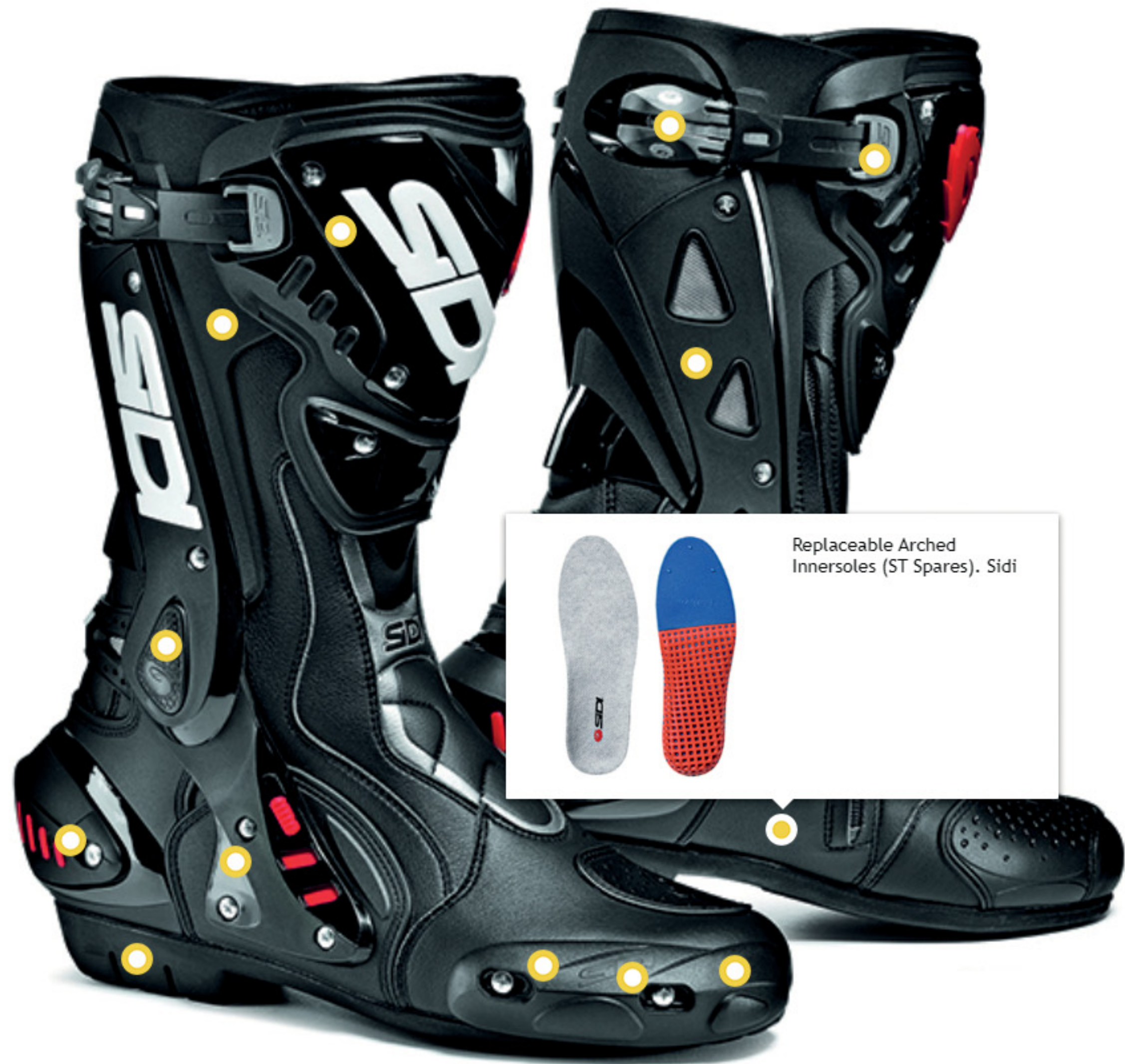
Replaceable Arched Insoles (ST Spares). Sidi