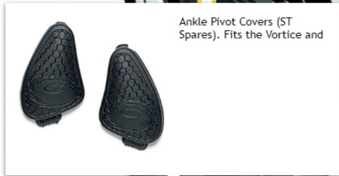
Ankle Pivot Covers (ST Spares). Fits the Vortice and