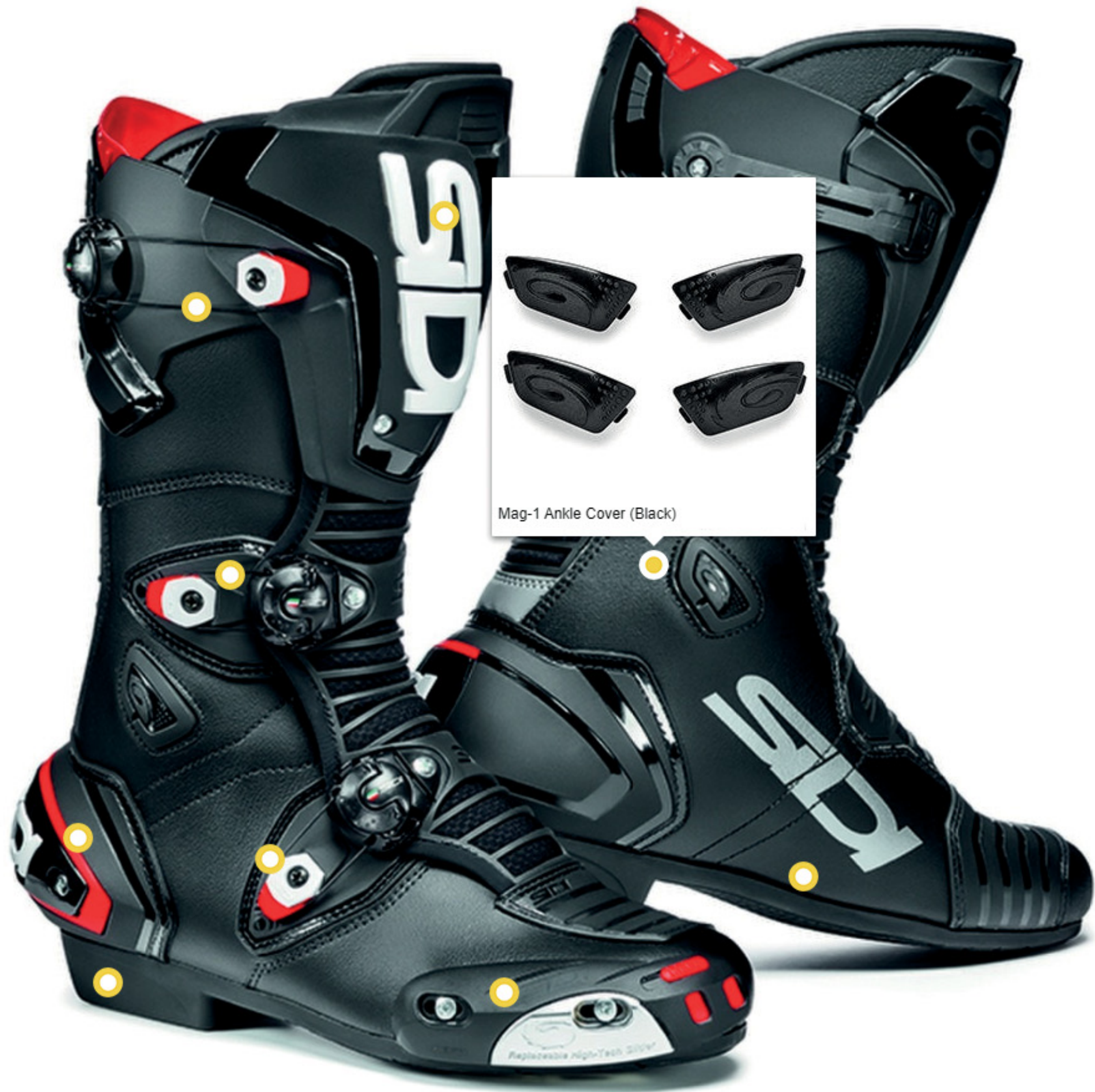
Mag-1 Ankle Cover (Black)