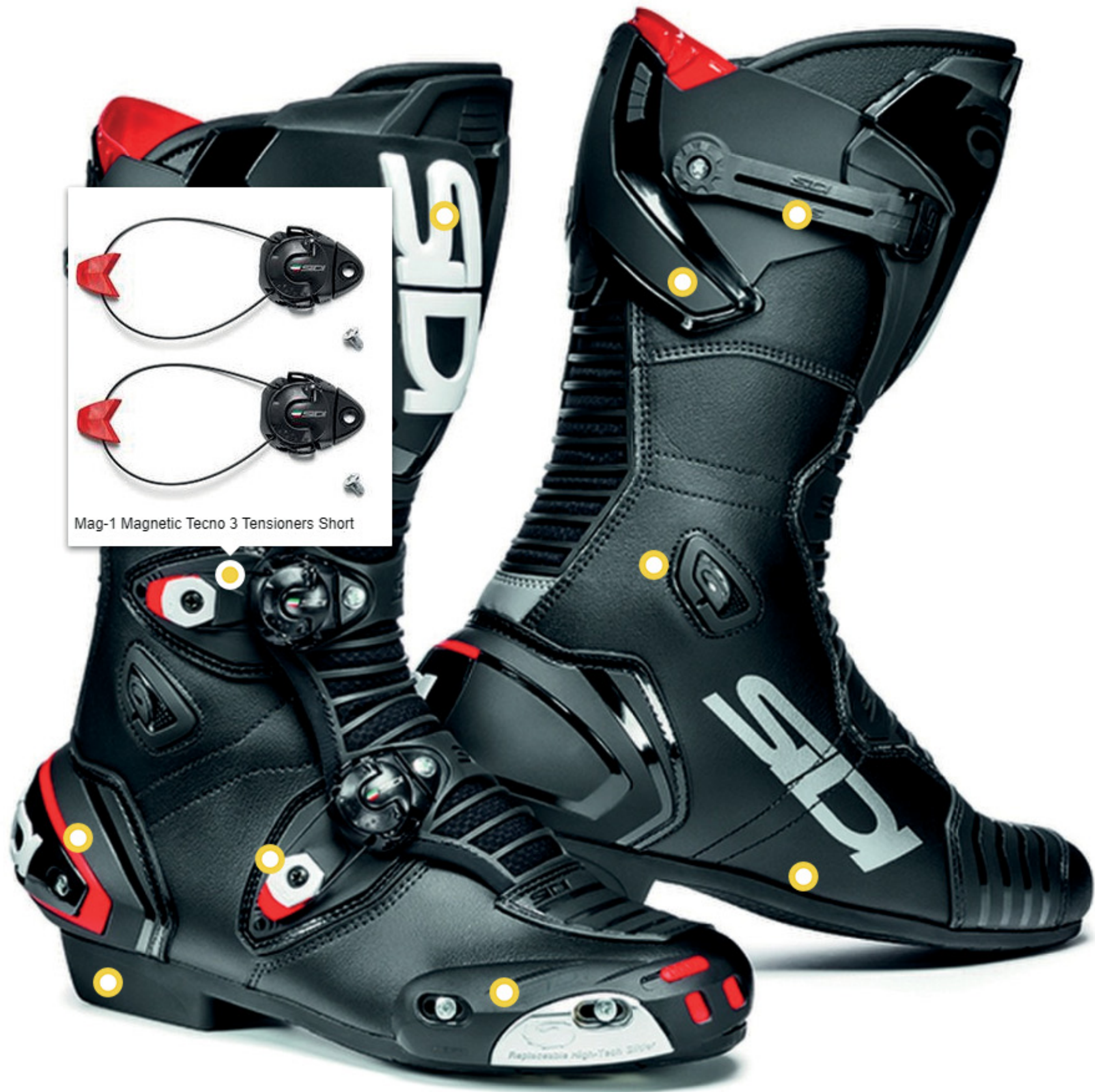
Mag-1 Magnetic Tecno 3 Tensioners Short