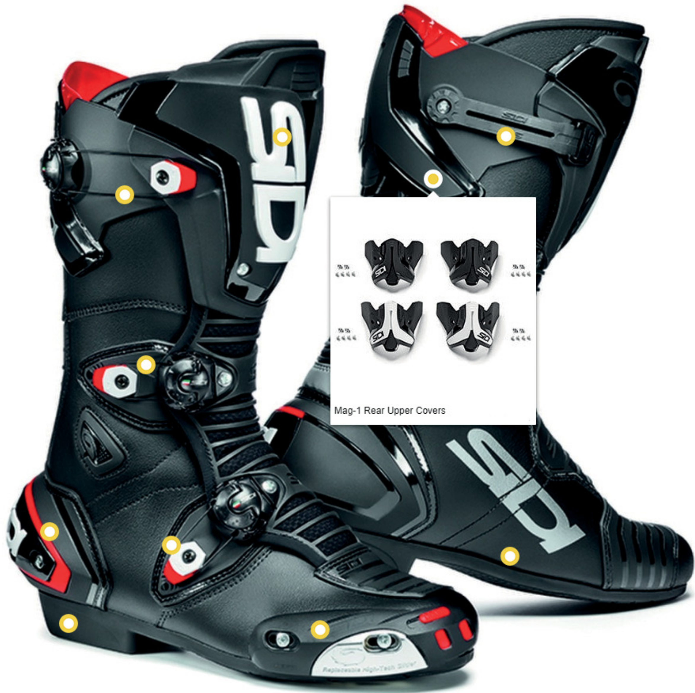
Mag-1 Rear Upper Covers