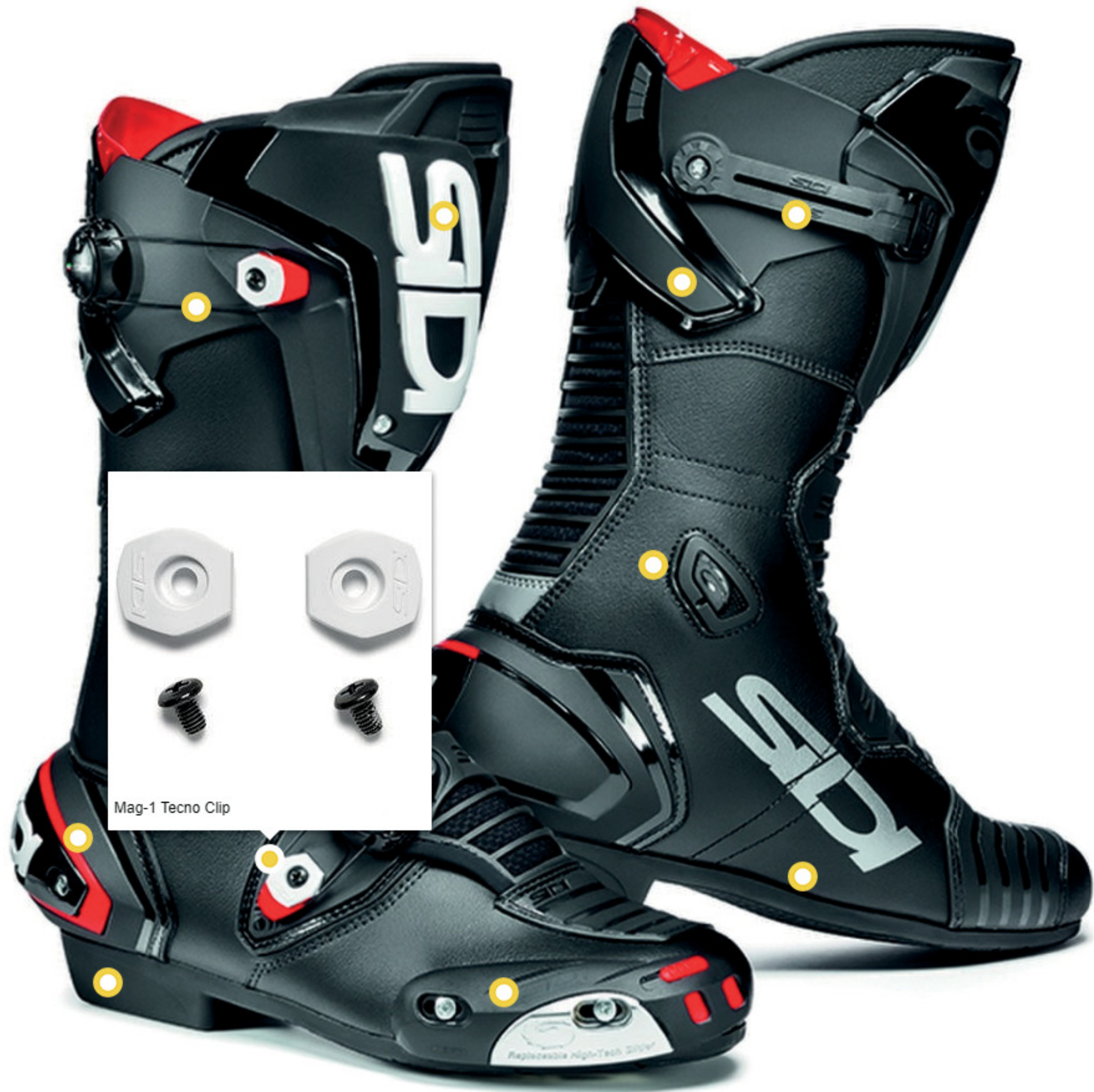
Mag-1 Tecno Clip