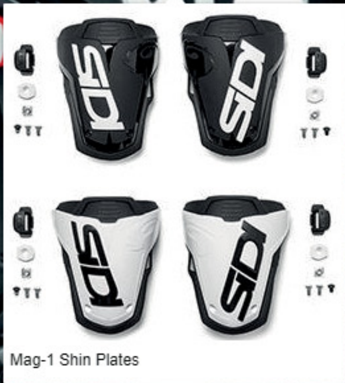
Mag-1 Shin Plates