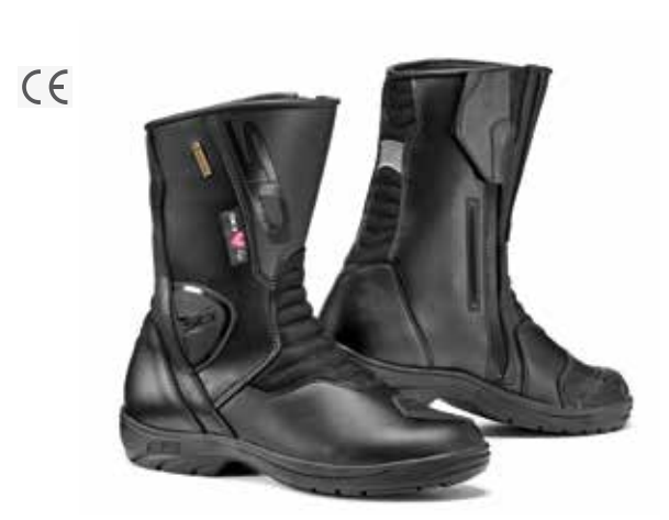
The "CE" marking means that the product meets the basic health and safety requirements of European Directive 89/686/EEC.

UPPER Upper in Full Grain Microfibre and suede LINING Lined with a Gore-Tex® waterproof-breathable membrane SOLE Non slip Rubber sole FITTING Specific insole for woma