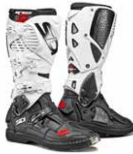
BLACK | WHITE