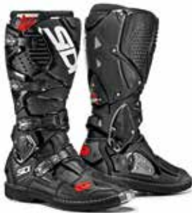
BLACK | BLACK