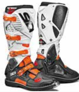
ORANGE FLUO | BLACK | WHITE