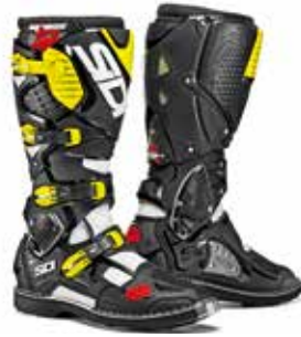
WHITE | BLACK | YELLOW FLUO