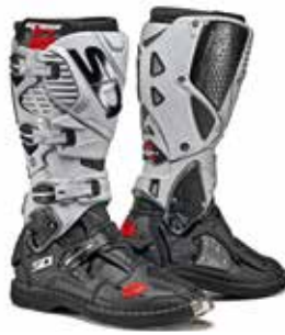
BLACK | ASH