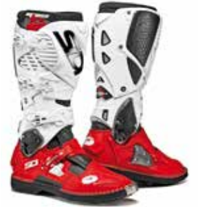
BLACK | RED | WHITE