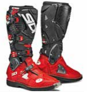
RED | RED | BLACK