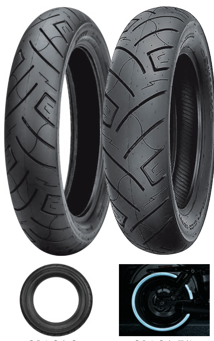
Reflector During Day