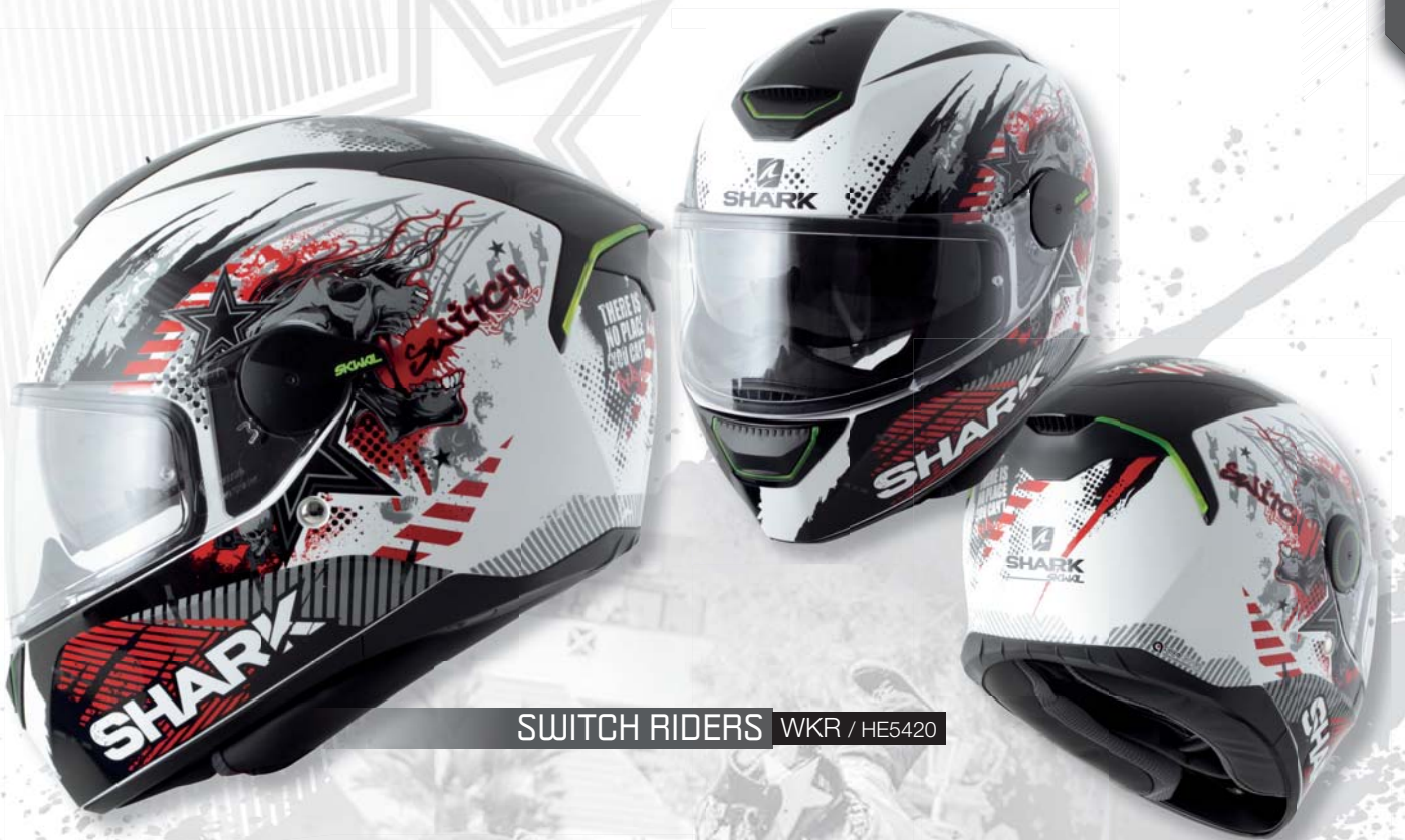
SWITCH RIDERS WKR / HE5420