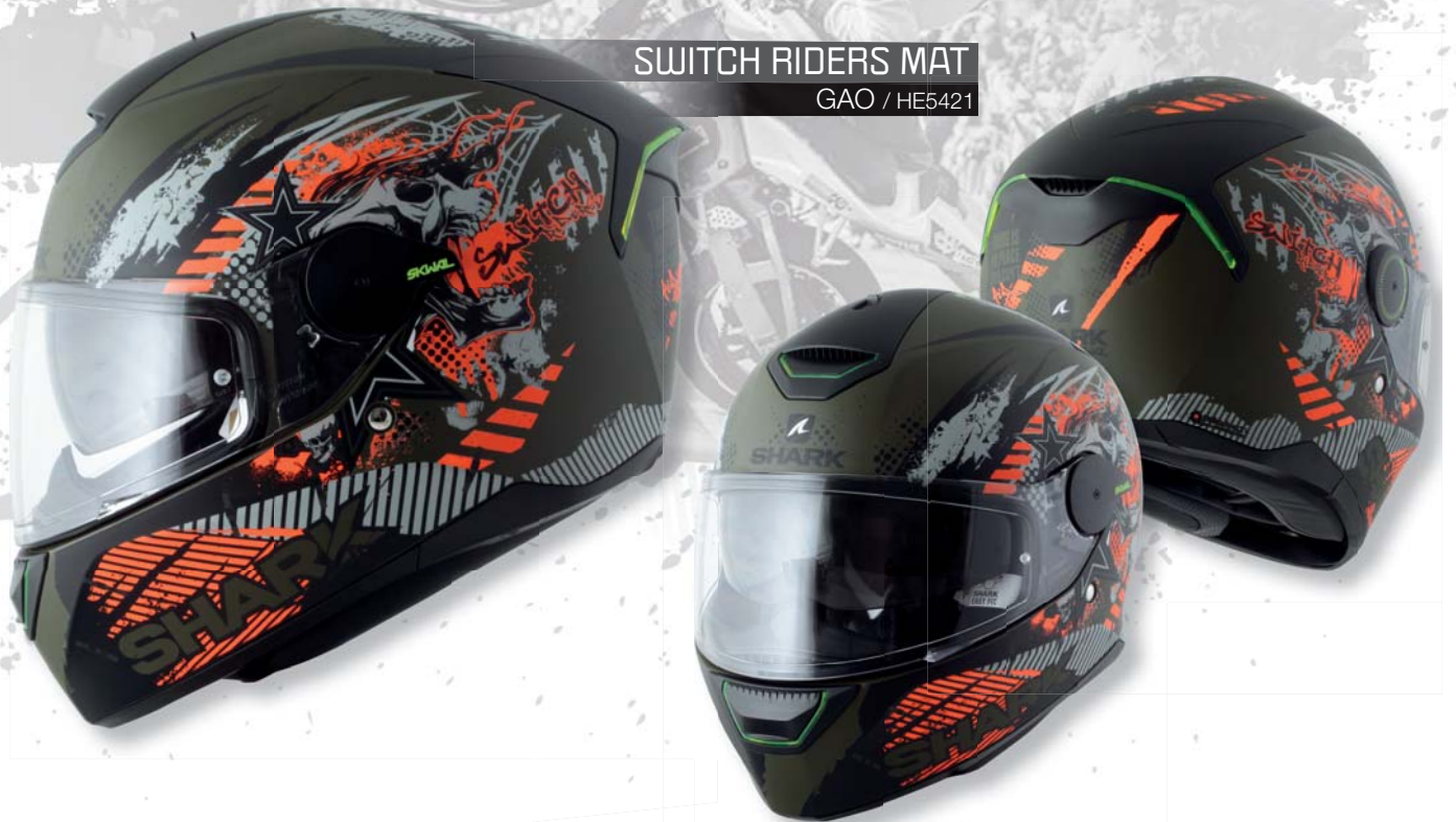
SWITCH RIDERS MAT GAO / HE5421