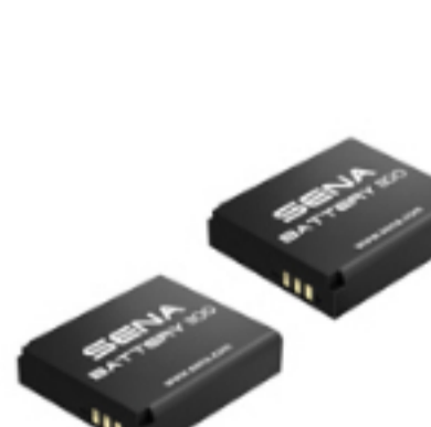
Li Ion Rechargeable Batteries