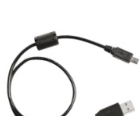
USB Power & Data Cable