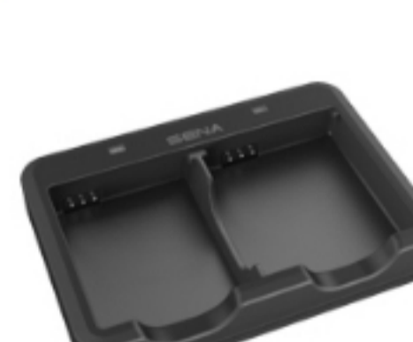
Dual Battery Charger