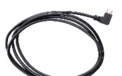
USB Power & Data Cable (Micro USB Type)