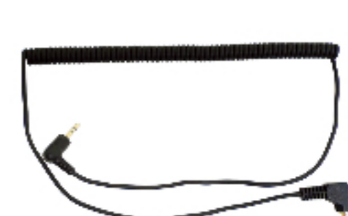
Stereo Audio Cable, 2.5mm to 3.5mm