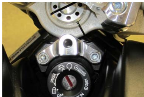
Bolt the frame bracket to the stock key