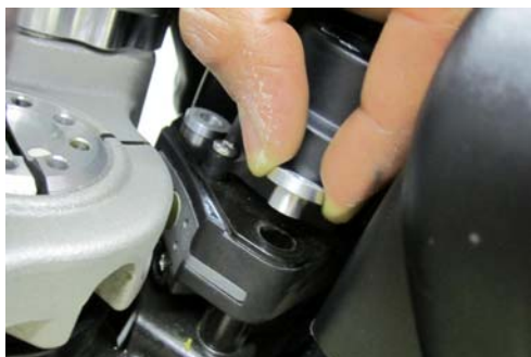
Install the bushings into the stock holes