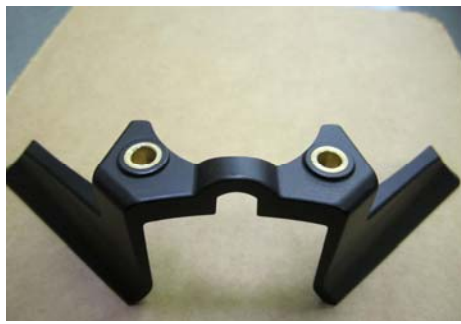
Cosmetic key cover you removed