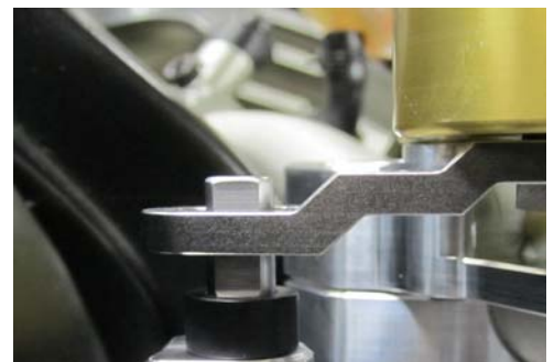
This shows the correct tower pin height