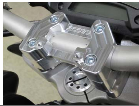
New bar mounts installed