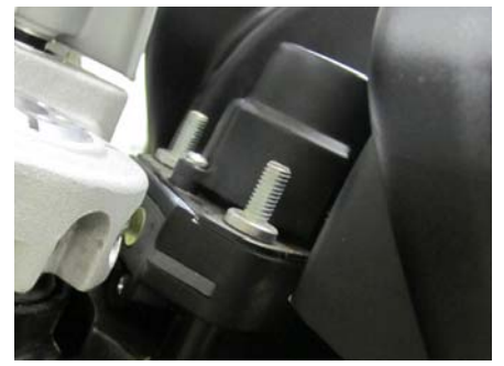
Remove the cosmetic key cover