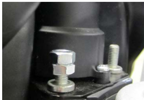
Double nut the key studs to be removed