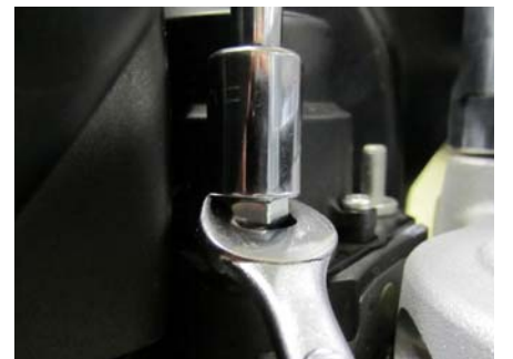
Remove the studs using 2 wrenches