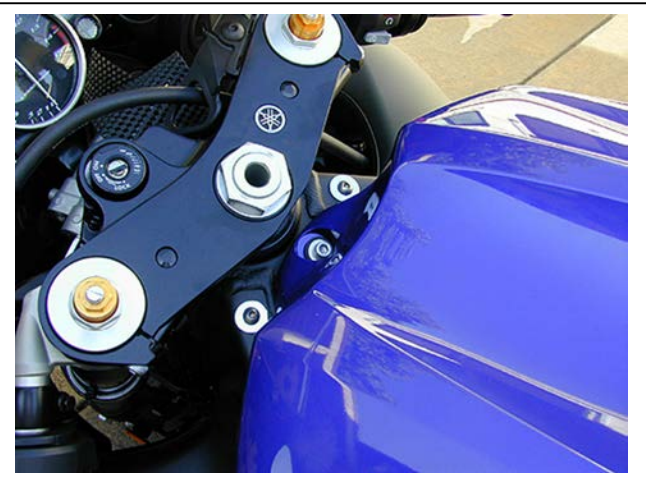
This photo shows the bike with the stabilizer kit removed and the holes plugged. We left them silver in the photo to show you how it looks, although the bolts and washers could be black to blend with the frame OR optional black plastic plugs like the ones Yamaha uses on the top of the triple clamp could be used as well.