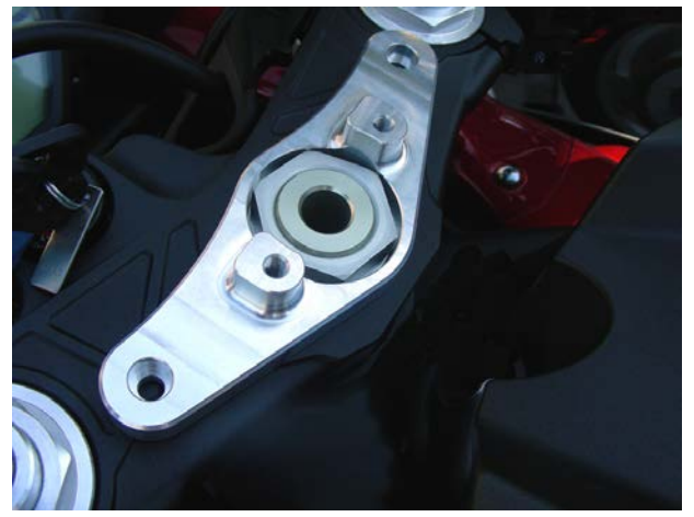
This photo shows the Triple clamp mount (TCM) aligned over the clip-on bolt holes