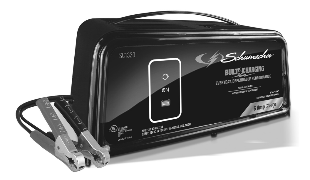
MODEL SC1320 Automatic Battery Charger OWNERS MANUAL

PLEASE SAVE THIS OWNERS MANUAL AND READ BEFORE EACH USE. This manual will explain how to use the battery charger safely and effectively. Please read and follow these instructions and precautions carefully.