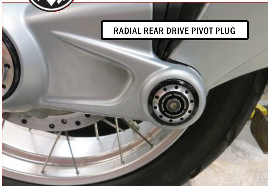
RADIAL REAR DRIVE PIVOT PLUG