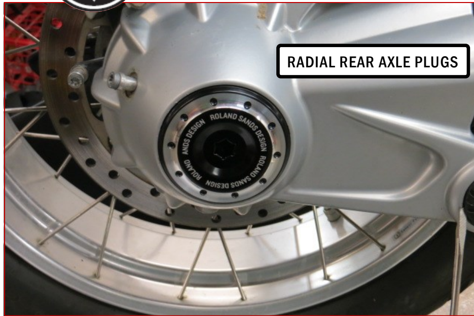
RADIAL REAR AXLE PLUGS