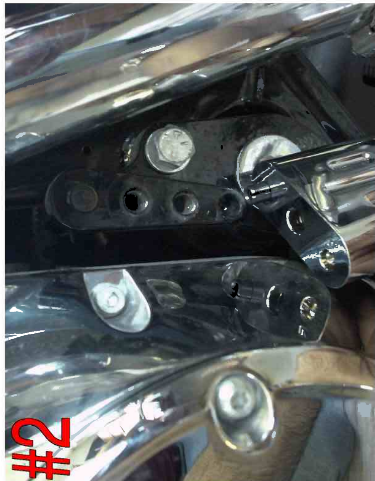
Rely only on high-grade motorcycle foot controls & pegs offered on our virtual shelves.