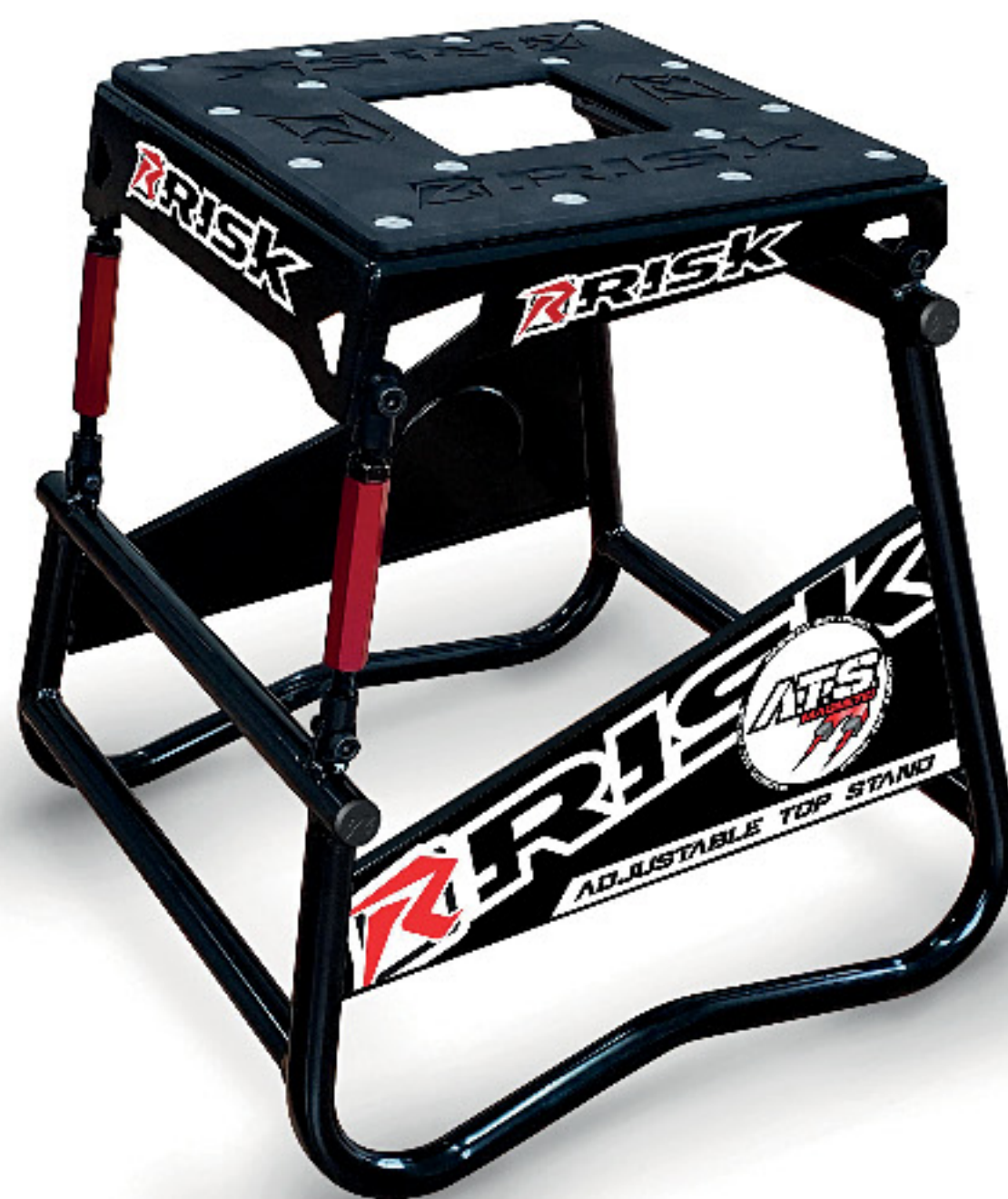
A.T.S. Magnetic Stand