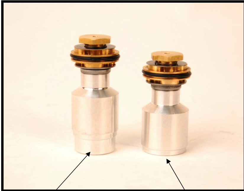
2004+ Race Tech Complete Compression Valve Assembly Kit FMGV S2057C (Long Base)