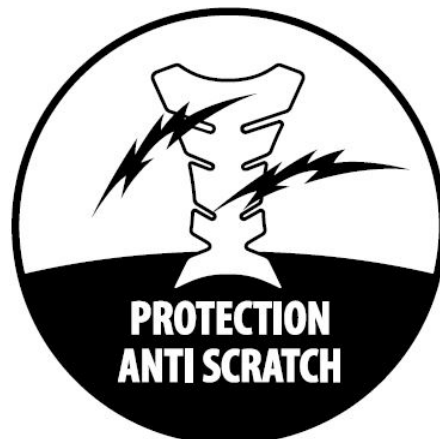
Protection anti scratch