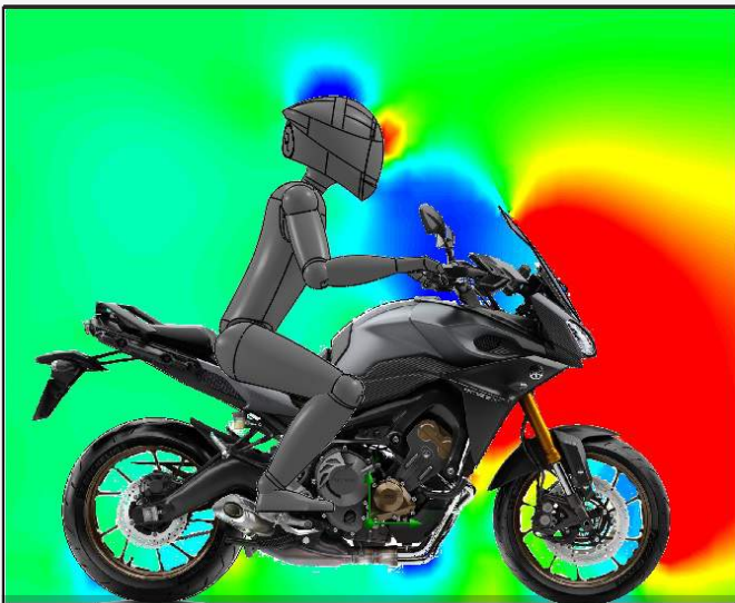
ORIGINAL SCREEN RESULTS