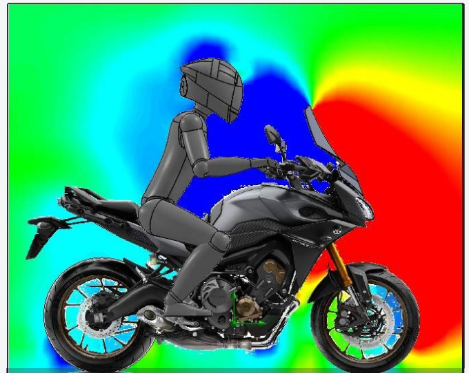
PUIG SCREEN RESULTS