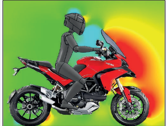
PUIG SCREEN RESULTS