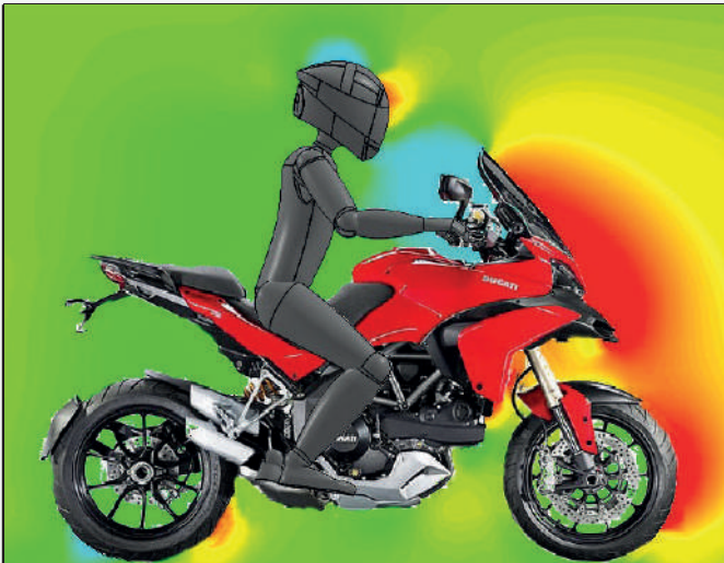
ORIGINAL SCREEN RESULTS