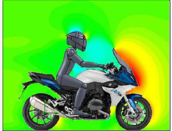
PUIG SCREEN RESULTS