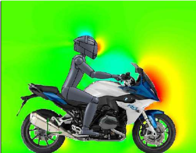
ORIGINAL SCREEN RESULTS