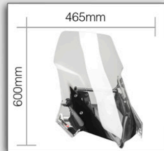
7600H (Touring screen + visor)