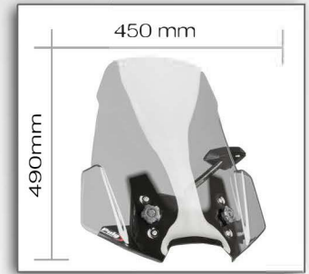
5999H+6320H (Touring screen + clip-on visor)