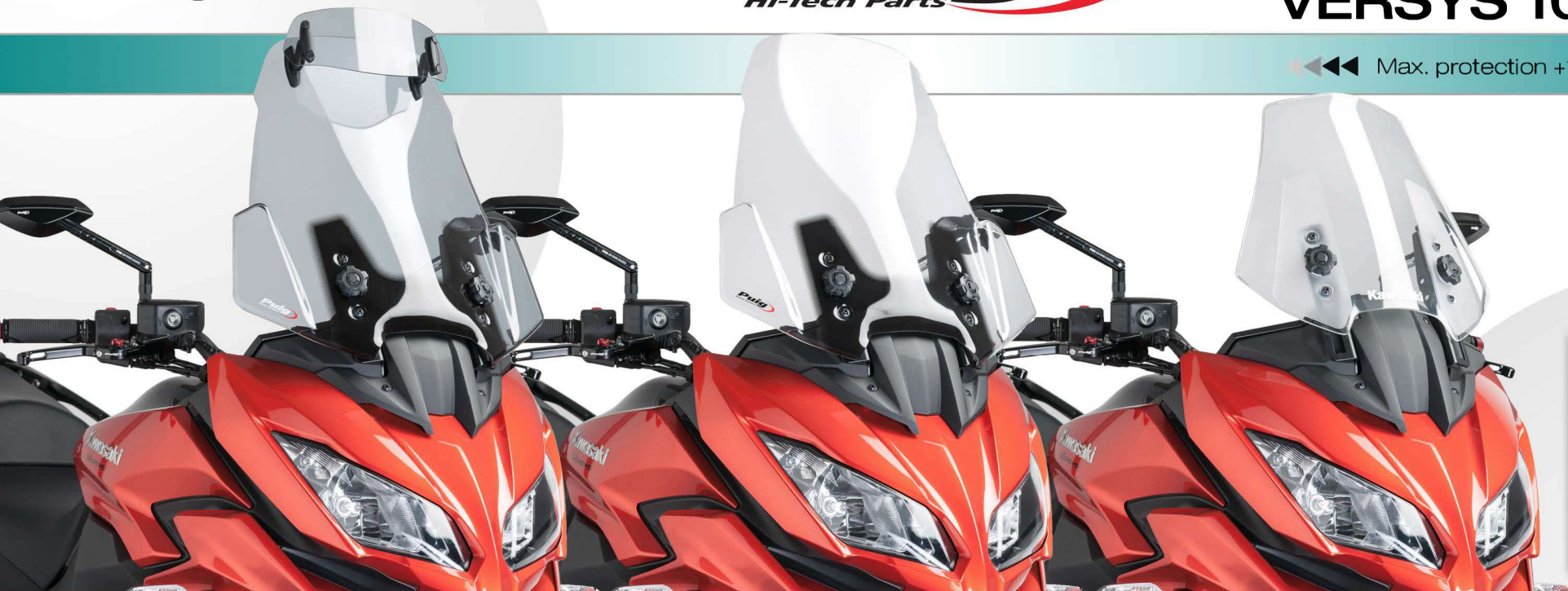
6005H (Touring screen + visor)

◀◀◀ Max. protection +130mm (5 1 / 8 ") ▶▶▶