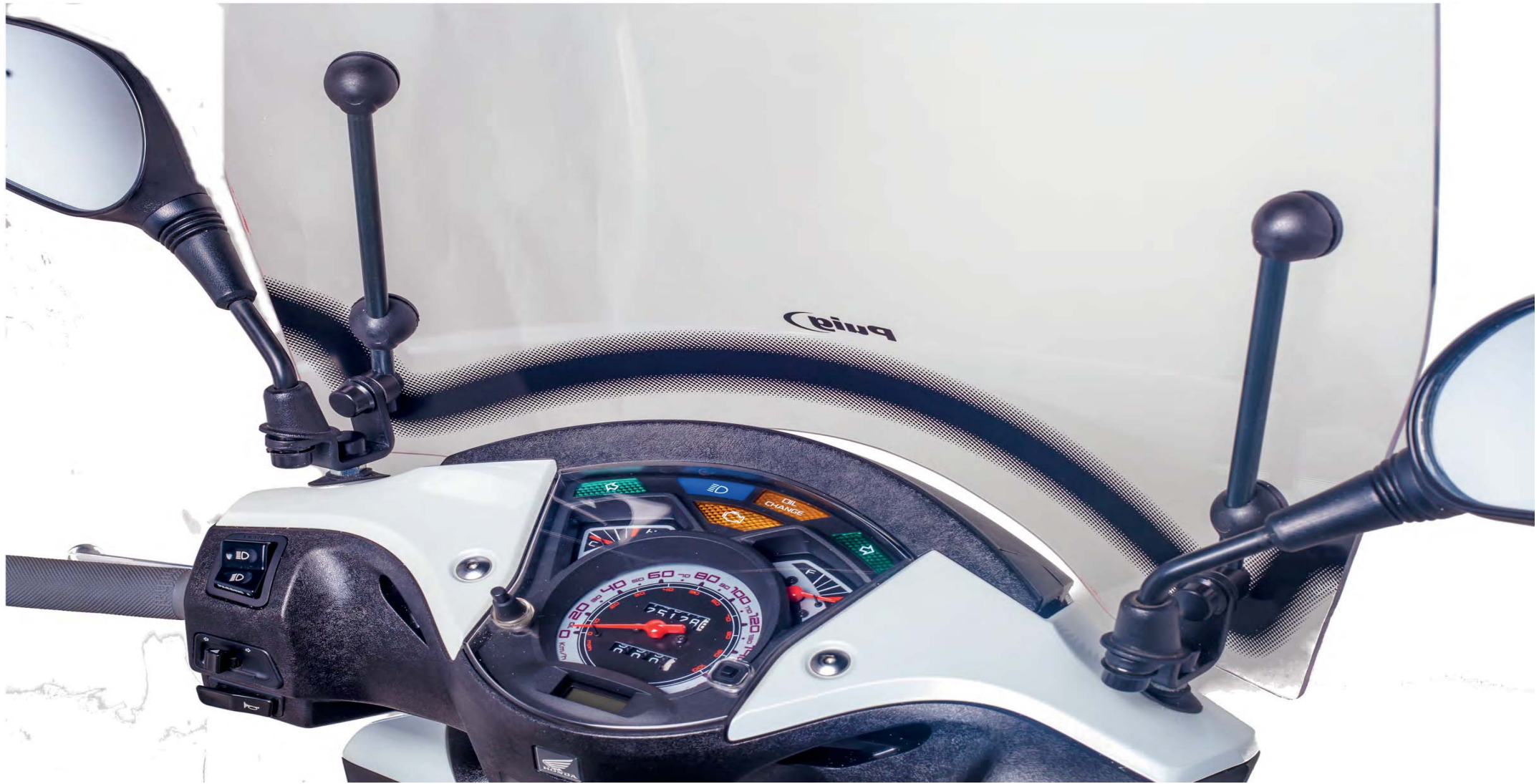
Puig puts everything within reach.