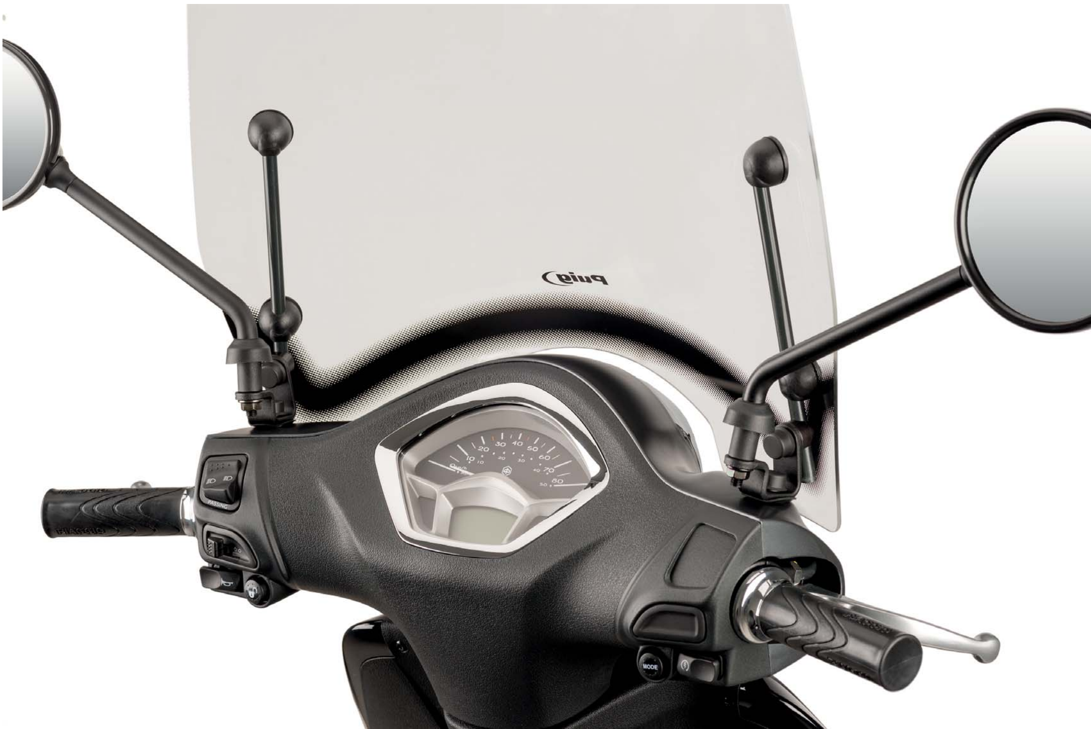
Puig puts everything within reach.