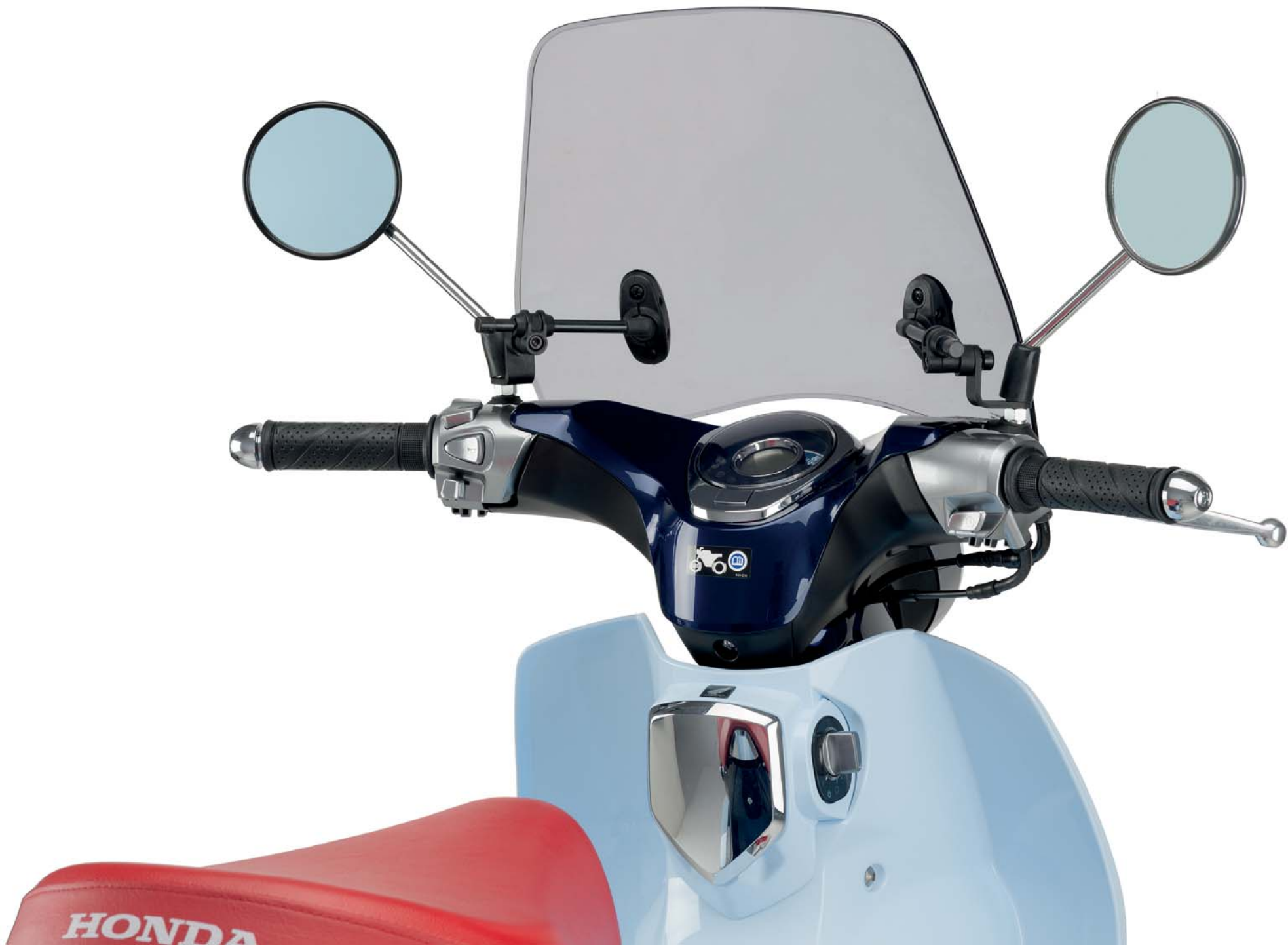
Puig puts everything within reach.