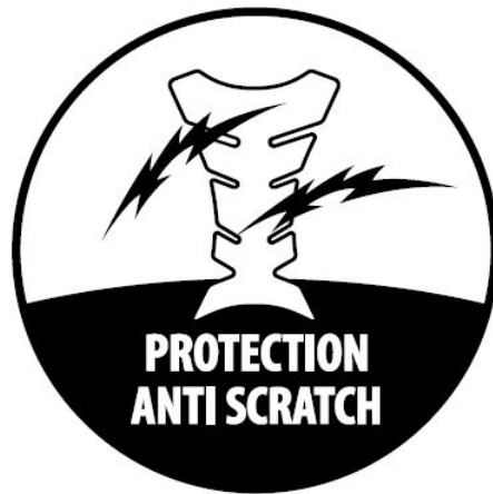
Protection anti scratch