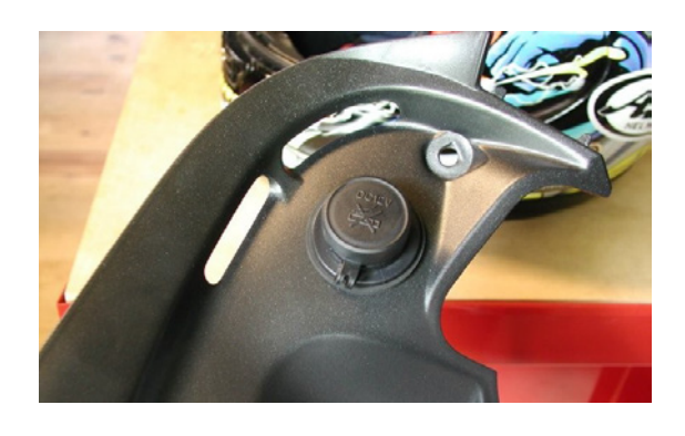
STEP #6 – Replace the panel and the seat. Enjoy!

STEP #5 – Apply the remaining ty-wrap to the wiring harness and the existing wiring harness. Do NOT allow the harness to directly contact the motor or exhaust.