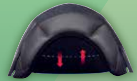
Maximized chin wind stopper can be adjusted for different positions.