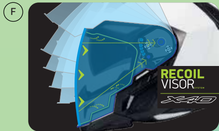
The Recoil Visor System with its spring-loaded base plates auto-adjusts and pull the shield back against the dual-lip window beading