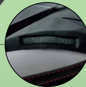
INTERCOM Prepared for Intercom installation; compatible with a wide range of universal Intercom Systems.